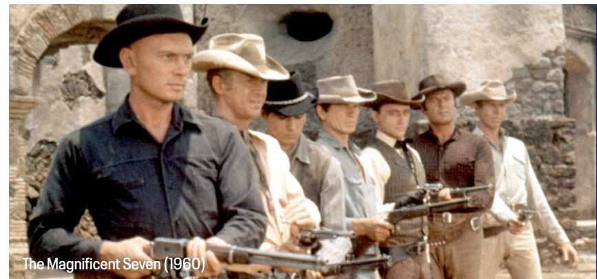
The Magnificent Seven (1960)