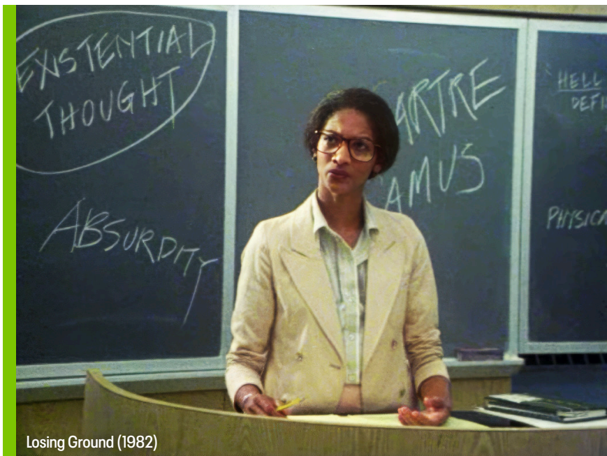
Losing Ground (1982)