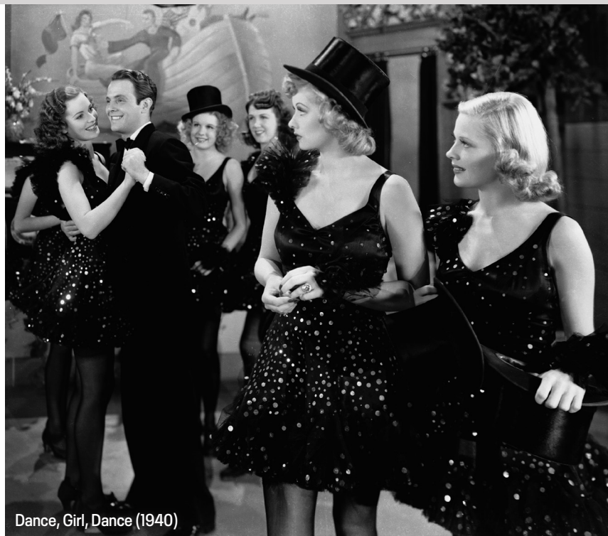
Dance, Girl, Dance (1940)