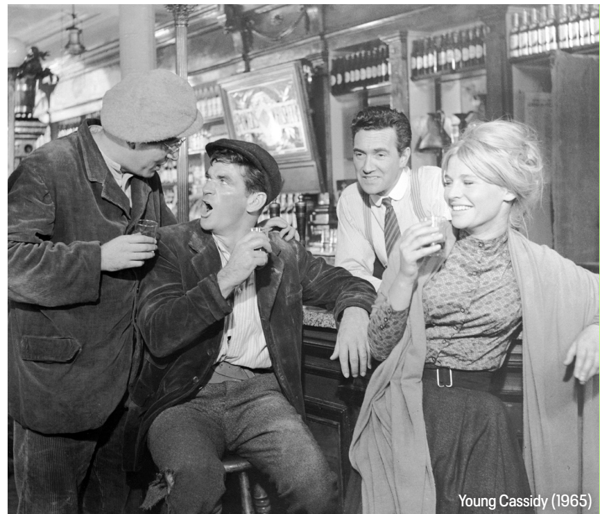
Young Cassidy (1965)

8:00 PM Double Indemnity (1944) 10:00 PM Sorry, Wrong Number (1948) 11:45 PM No Man of Her Own (1950)