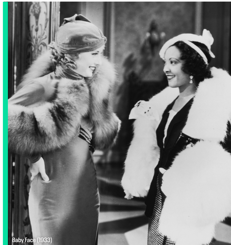
Baby Face (1933)