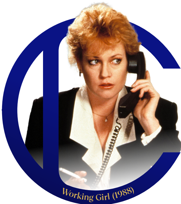
Working Girl (1988)