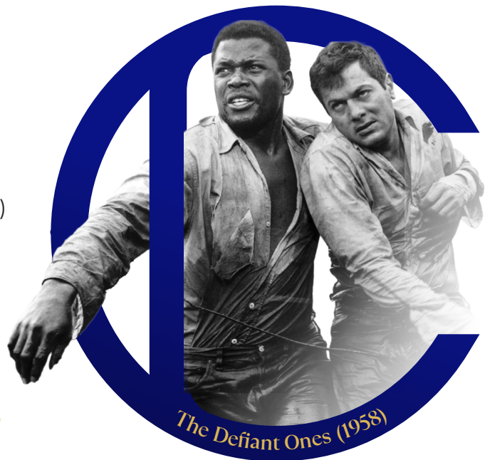
The Defiant Ones (1958)