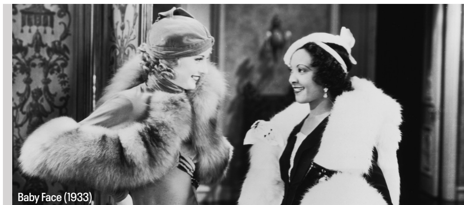
Baby Face (1933)