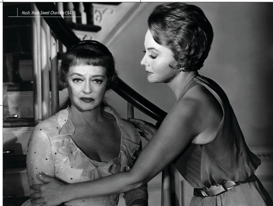
Hush...Hush, Sweet Charlotte ('64)