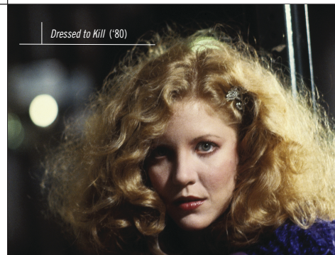
Dressed to Kill ('80)