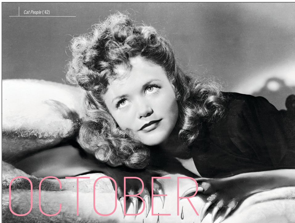
Cat People ('42)