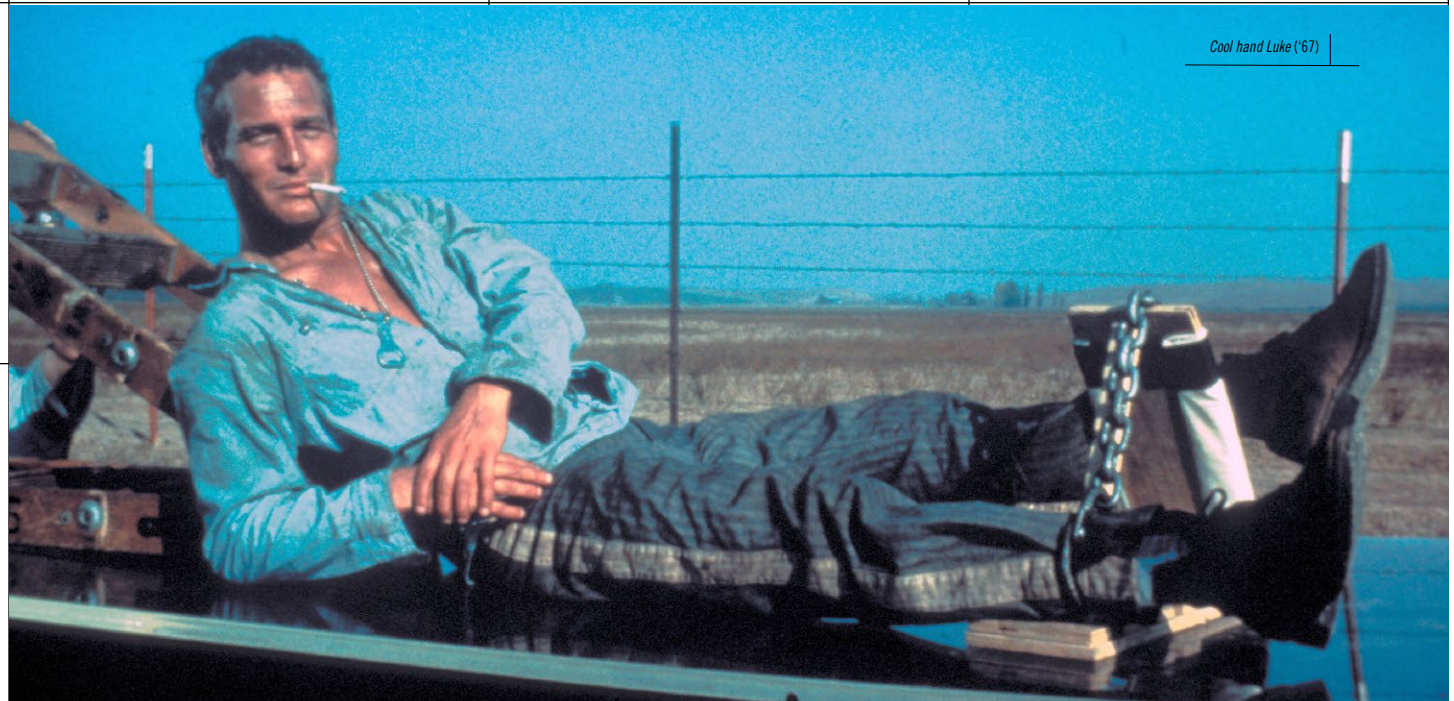
Cool hand Luke ('67)

8:00 PM Psycho ('60) 10:00 PM Dr. Jekyll and Mr. Hyde ('31) 12:00 AM Poltergeist ('82) 2:00 AM What Ever Happened To Baby Jane? ('62) 4:15 AM Bride of Frankenstein ('35)