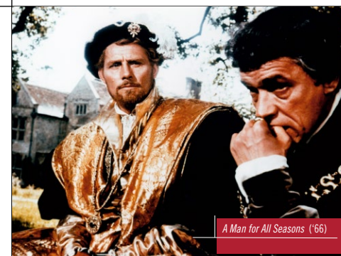
A Man for All Seasons ('66)